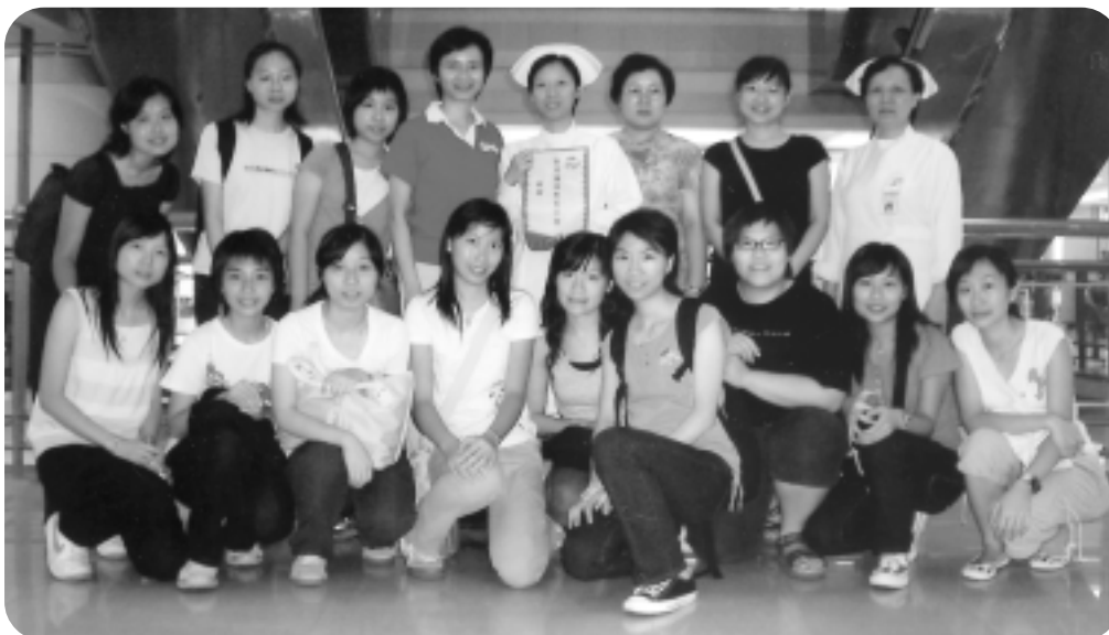
蘇副主席和各同學在中山大學第一附屬醫院大堂留影