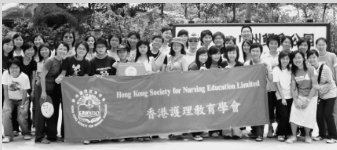
團員興致勃勃，暢遊全球最大的廣州鱷魚公園，大開眼界